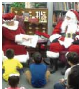
Santa & Mrs. Claus reading stories at Santa Storytime.